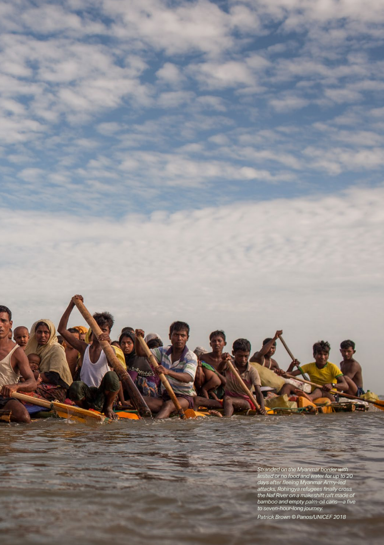
Stranded on the Myanmar border with limited or no food and water for up to 20 days after fleeing Myanmar Army-led attacks, Rohingya refugees finally cross the Naf River on a makeshift raft made of bamboo and empty palm-oil cans—a five to seven-hour-long journey.