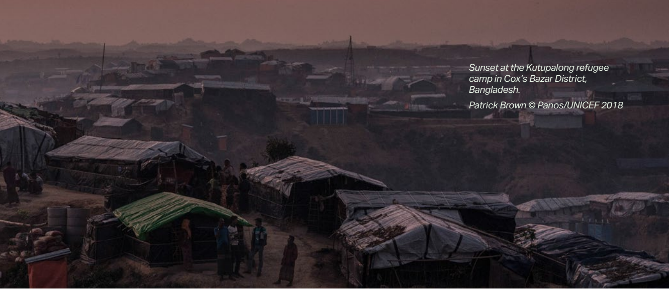
Sunset at the Kutupalong refugee camp in Cox's Bazar District, Bangladesh.