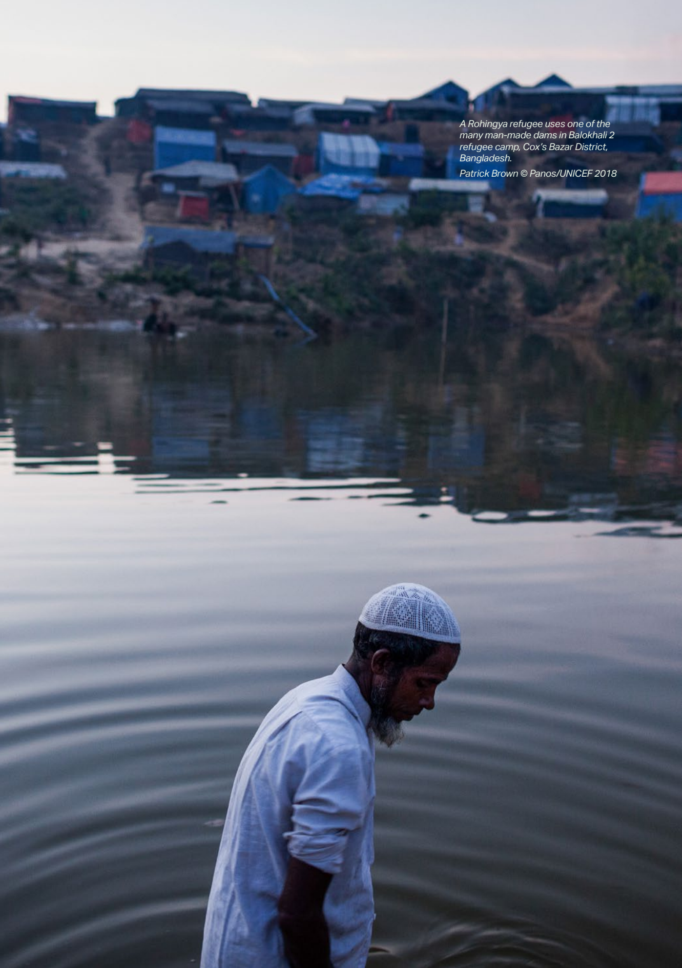
A Rohingya refugee uses one of the many man-made dams in Balokhali 2 refugee camp, Cox's Bazar District, Bangladesh.