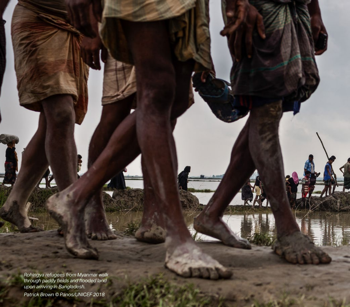
Rohingya refugees from Myanmar walk through paddy fields and flooded land upon arriving in Bangladesh.